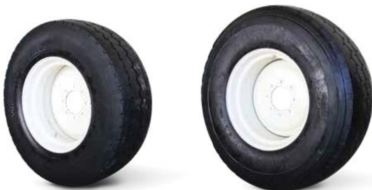
385 x 22.5 (15 x 22.5)