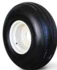
14L x 16.1 8 Ply