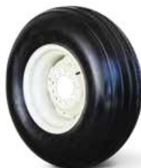
11L x 15 8 Ply