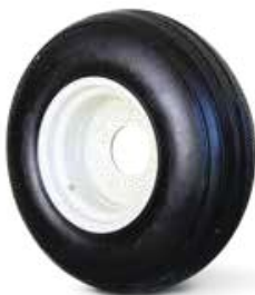
12.5L x 16 14 Ply