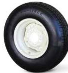
235/85 R16 Load Range F