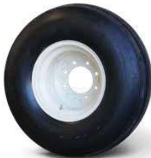
12.5L x 15 Load Range F