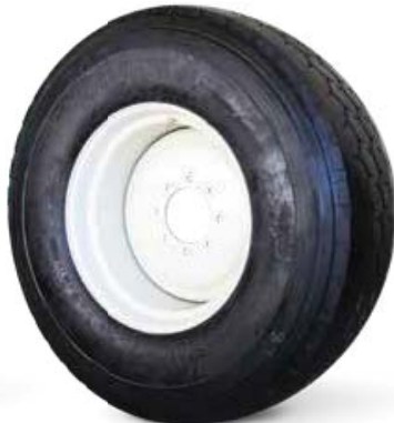
425 x 22.5 (16 x 22.5)