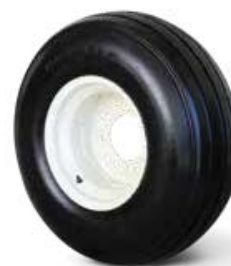
12.5L x 15 12 Ply