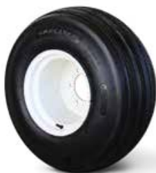
26x12 12 Ply