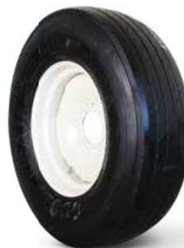
12 or 315 x 22.5