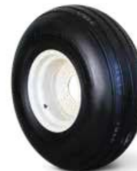
14L x 16.1 12 Ply