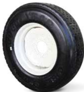
11 x 22.5

* Capacities on recap tires are approximate