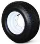
20.5 x 8-10 Load Range F