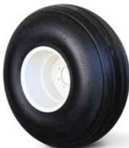
16.5 x 16.1 10 Ply