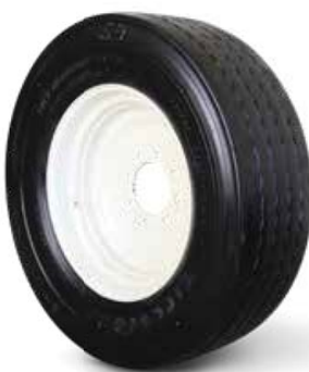
305 x 22.5