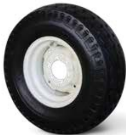
11L x 15 Load Range F