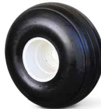
21.5 x 16.1 14 Ply

** Images shown for approximate size and profile of tire and rim package only. Relative wheel picture sizing is approximate.