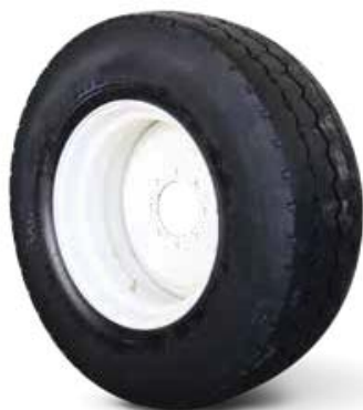
385 x 22.5 (15 x 22.5)