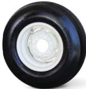
11L x 15 Load Range D