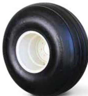
19L x 16.1 10 Ply