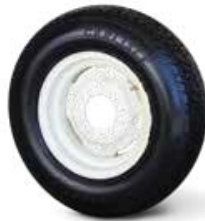
225/75 R15 Load Range D