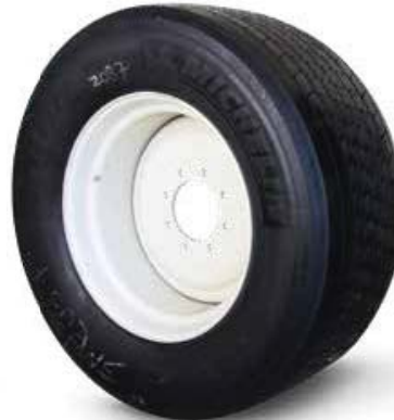
445 / 50 x 22.5